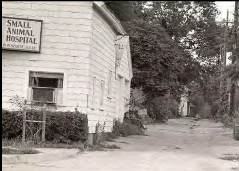
View of the alley, 900 block of New Hampshire Street.